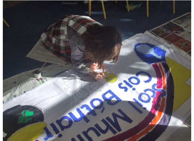
Emma gets creative!