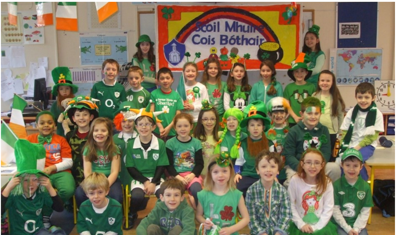
“Lá le Pádraig”, Second Class.